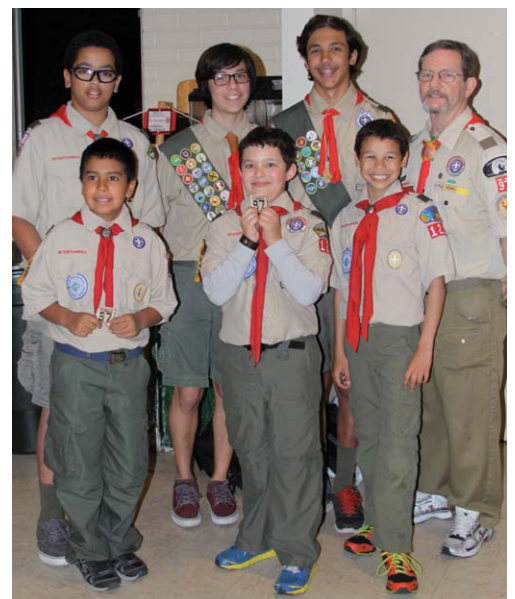
From Pack 1218