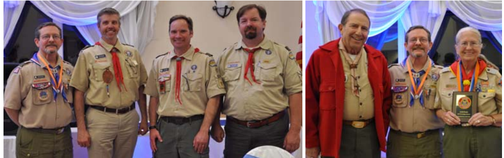
Bottom Left: Bouldering at Joshua Tree. Above: Six Troop 97 adults were honored at the District Awards Dinner for extraordinary volunteerism. Article on page 2.